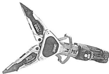
SP 555E2 (28.7") Spreader: