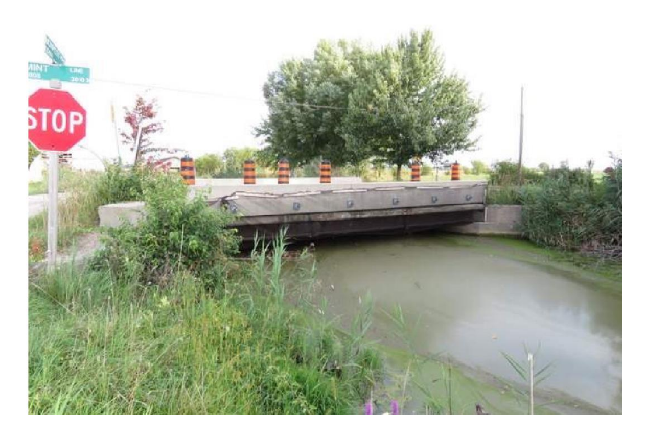
Figure 1. Mint Line over King and Whittle Drain