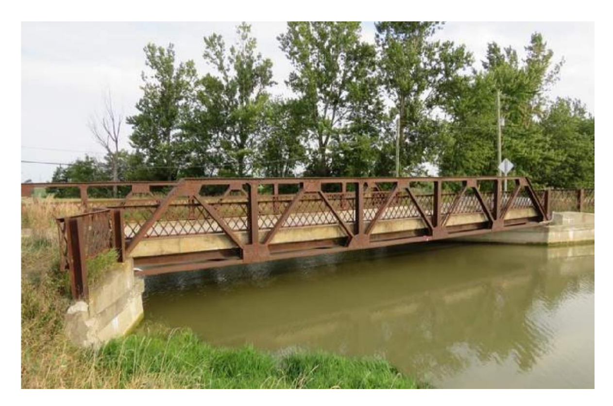
Figure 2. Mint Line over Baptiste Creek