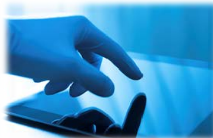
INFORMATION TECHNOLOGY/ INFORMATION MANAGEMENT