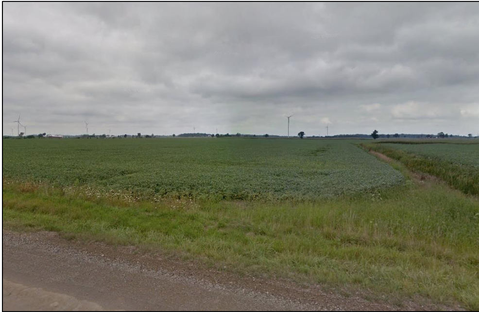
Looking northwest towards the retained parcel.