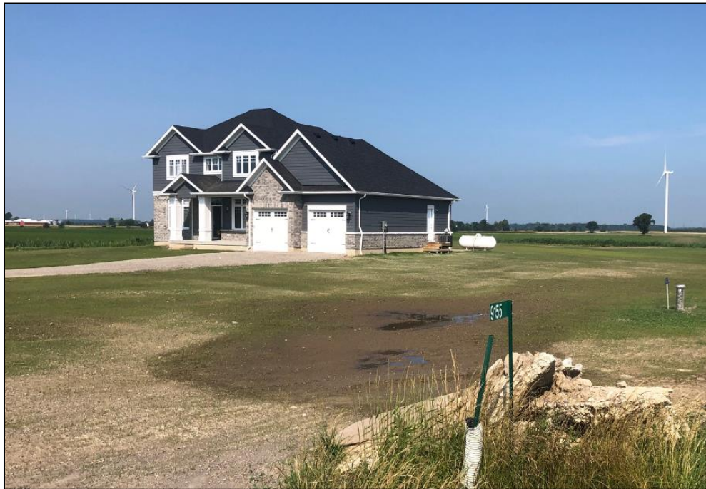
Looking west towards the dwelling on the proposed severed parcel.